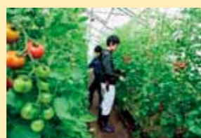
Agricultural training at Mie Prefectural Agricultural College