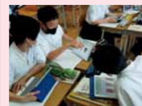
Class conducted with the use of information and communication technology (ICT)