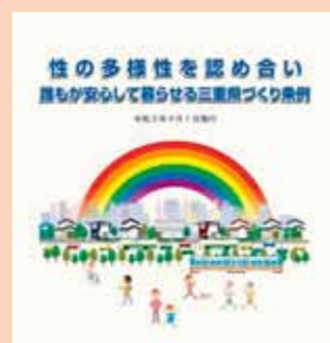
Mie Prefecture's ordinance enacted for the realization of a society where everybody accepts sexual diversity and can live with a sense of security