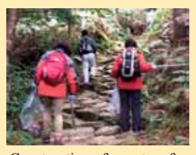
Construction of a system for the preservation of the Kumano Kodo Iseji Route