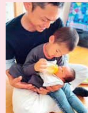
Photography contest for fathers caring for their children