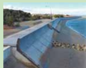
Improvement of embankments, etc. to prevent tsunamis and storm surges