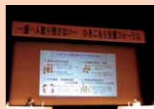
Forum held to support shut-ins