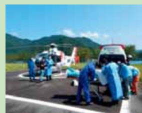
Support for medical emergency helicopter services, etc.