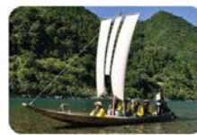
sandanbo (Kihō Town)

Tickets for Hands-On Experience in Mie 10 Winners