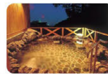
Hotel Yunomoto (Komono Town)

Overnight stay vouchers for two in Mie 10 Winners