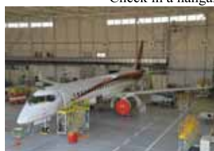
Check in a hangar