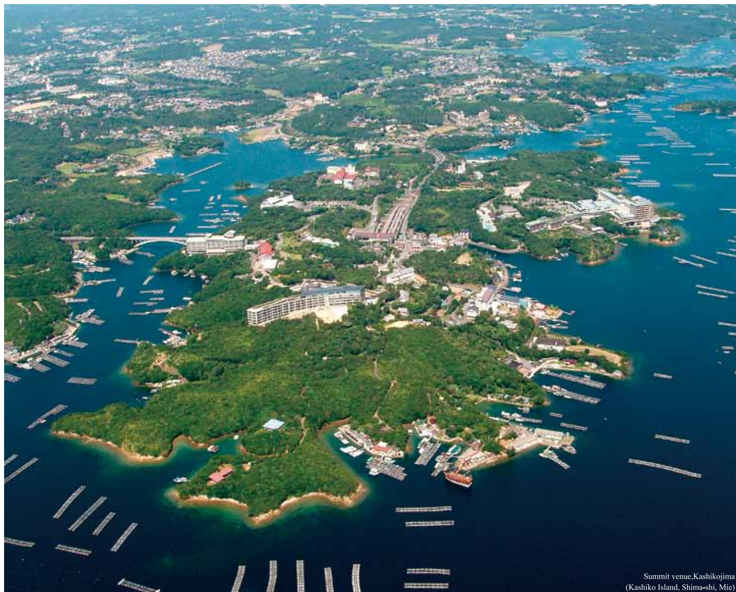
Summit venue, Kashikojima (Kashiko Island, Shima-shi, Mie)