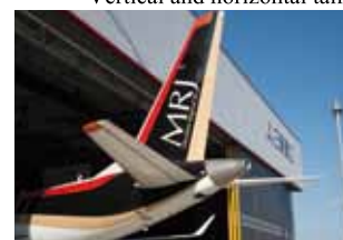
Vertical and horizontal tails